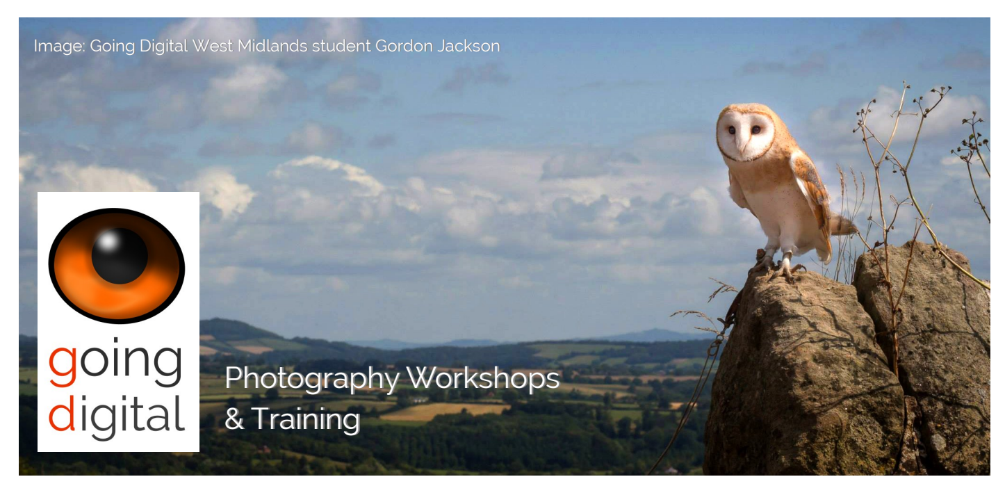
Number 1 for photography workshops & training since 2005

We've been passing on our photography knowledge and skills since 2005 and we've earned a reputation for enjoyable, high quality, competitively priced one-day workshops. You'll find us in 130 venues, so you won't have far to travel.