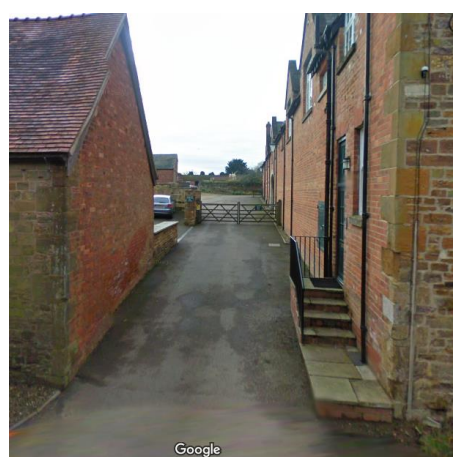
The Old Laundry